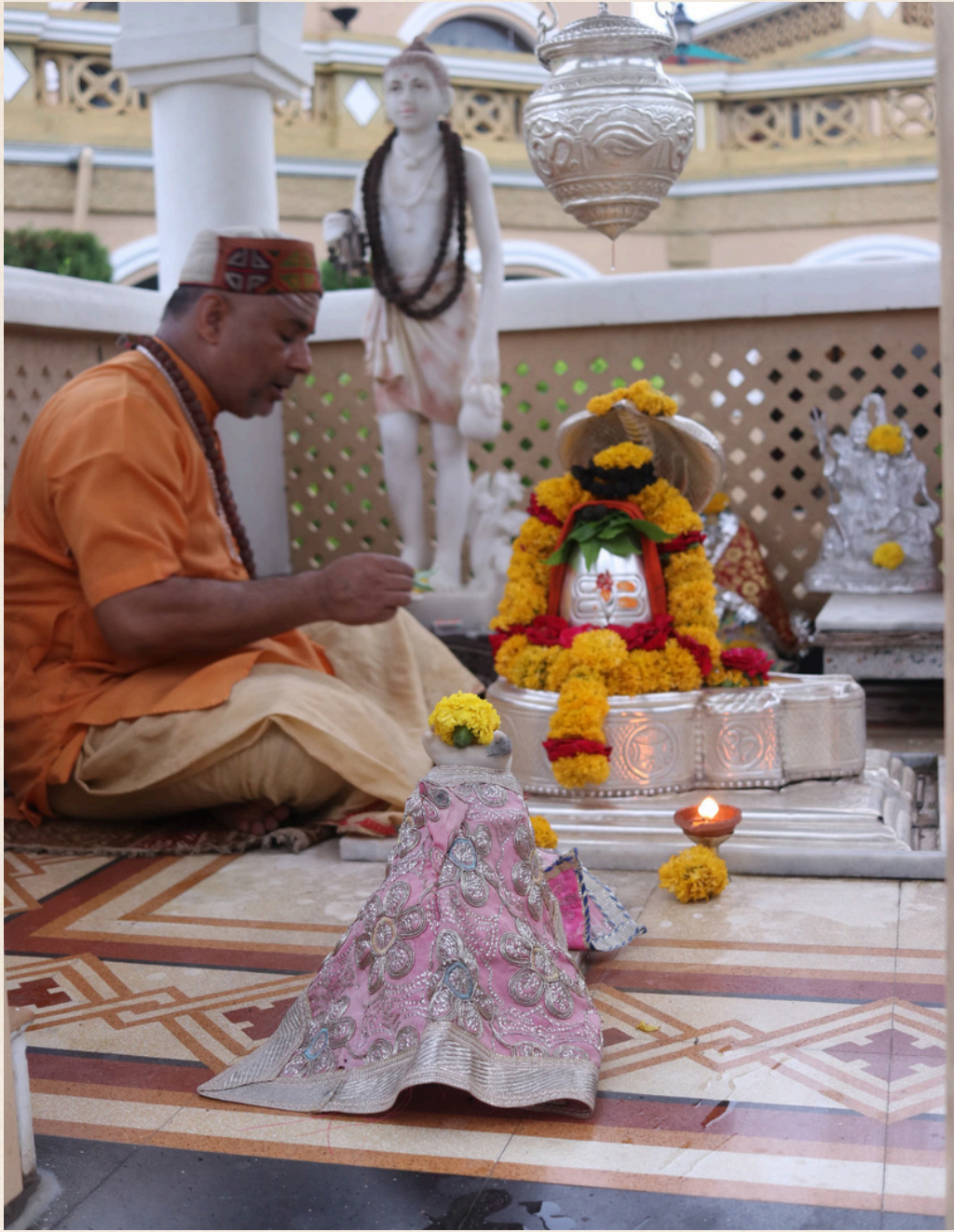
Above - A divine tribute at Heritage Khirasara Palace — the sacred Shivling adorned in grace and tradition.