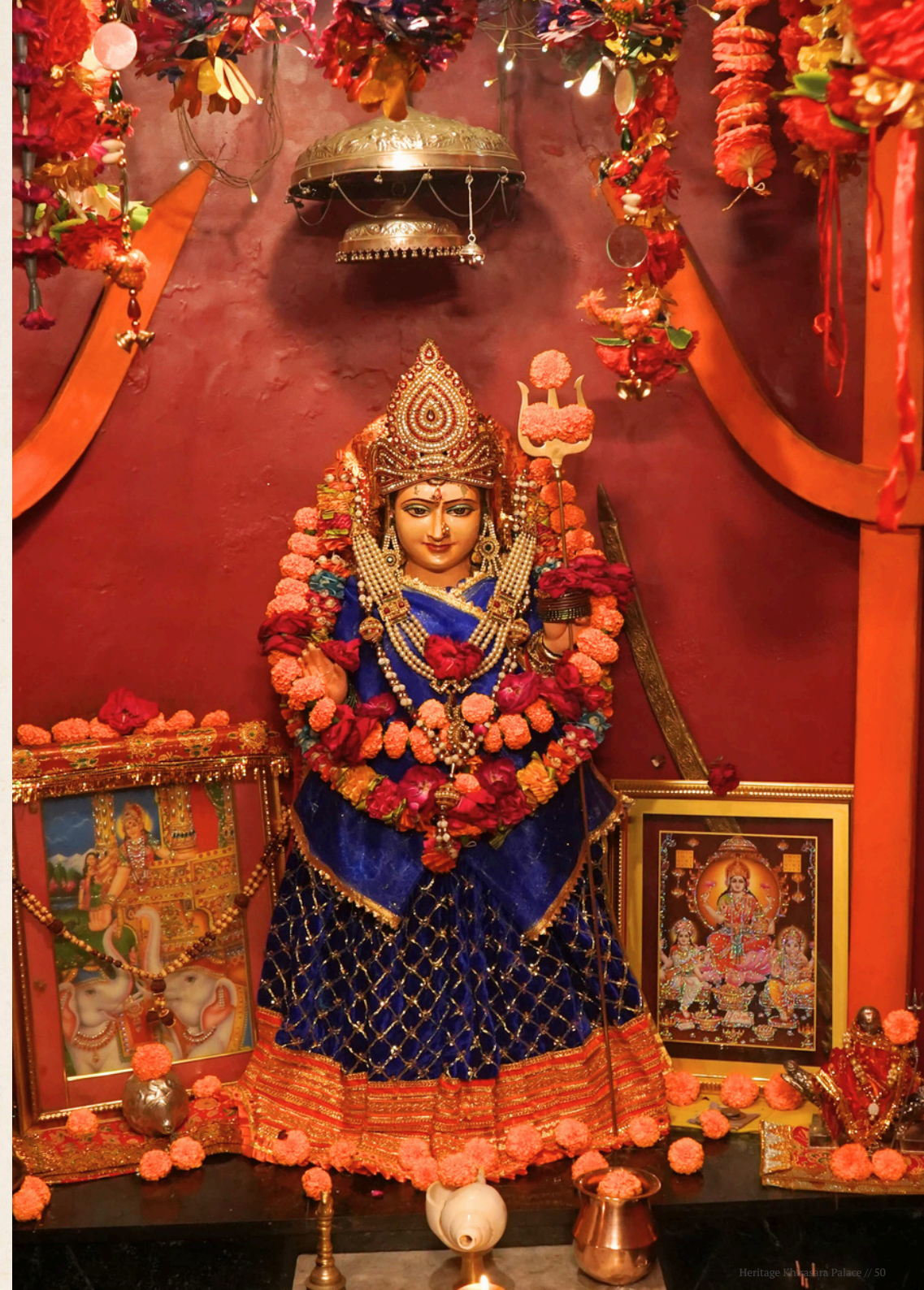
Right - An evening heritage walk begins at the 400-year-old temple of Goddess Khodiyar Maa, where history softly breathes.