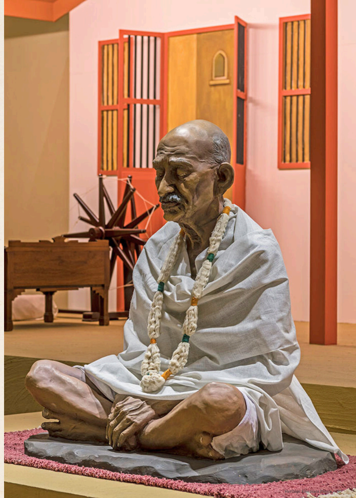
Right - Mahatma Gandhi Museum in Rajkot stands as a tribute to the legacy of peace and resilience in his hometown.