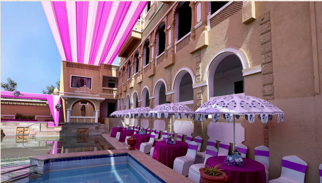
Above - Celebrate your dream wedding in the regal splendour of our majestic Darbar Hall, where every moment feels one-of-a-kind.