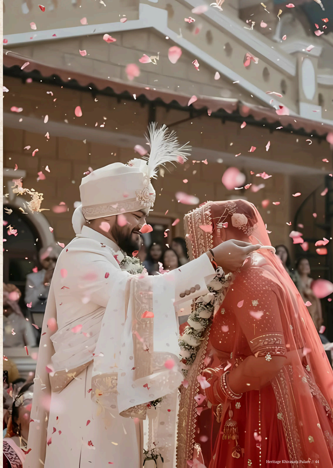
Right - A timeless moment of love and tradition captured during a wedding celebration at Heritage Khirasara Palace.