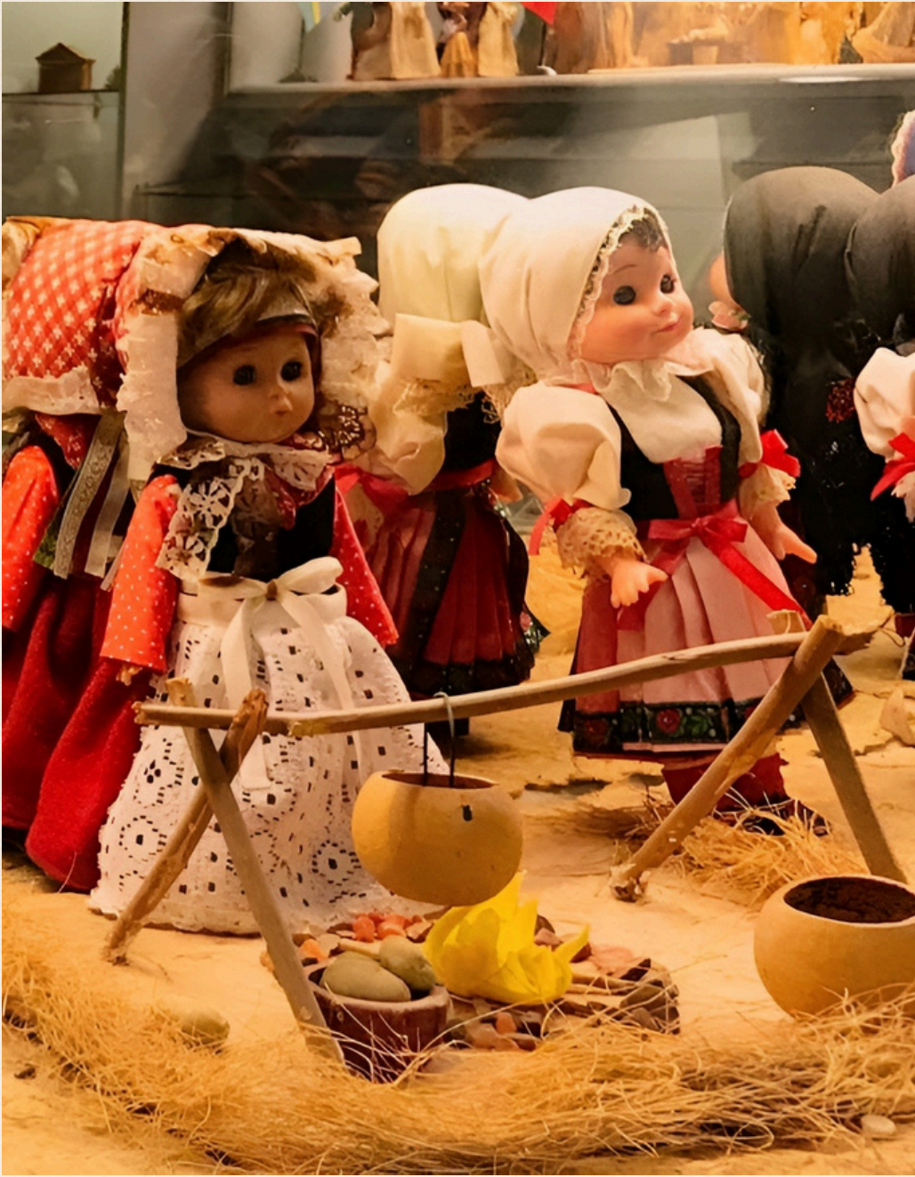
Above - Rotary Dolls Museum is a vibrant showcase of global cultures through an enchanting collection of dolls.