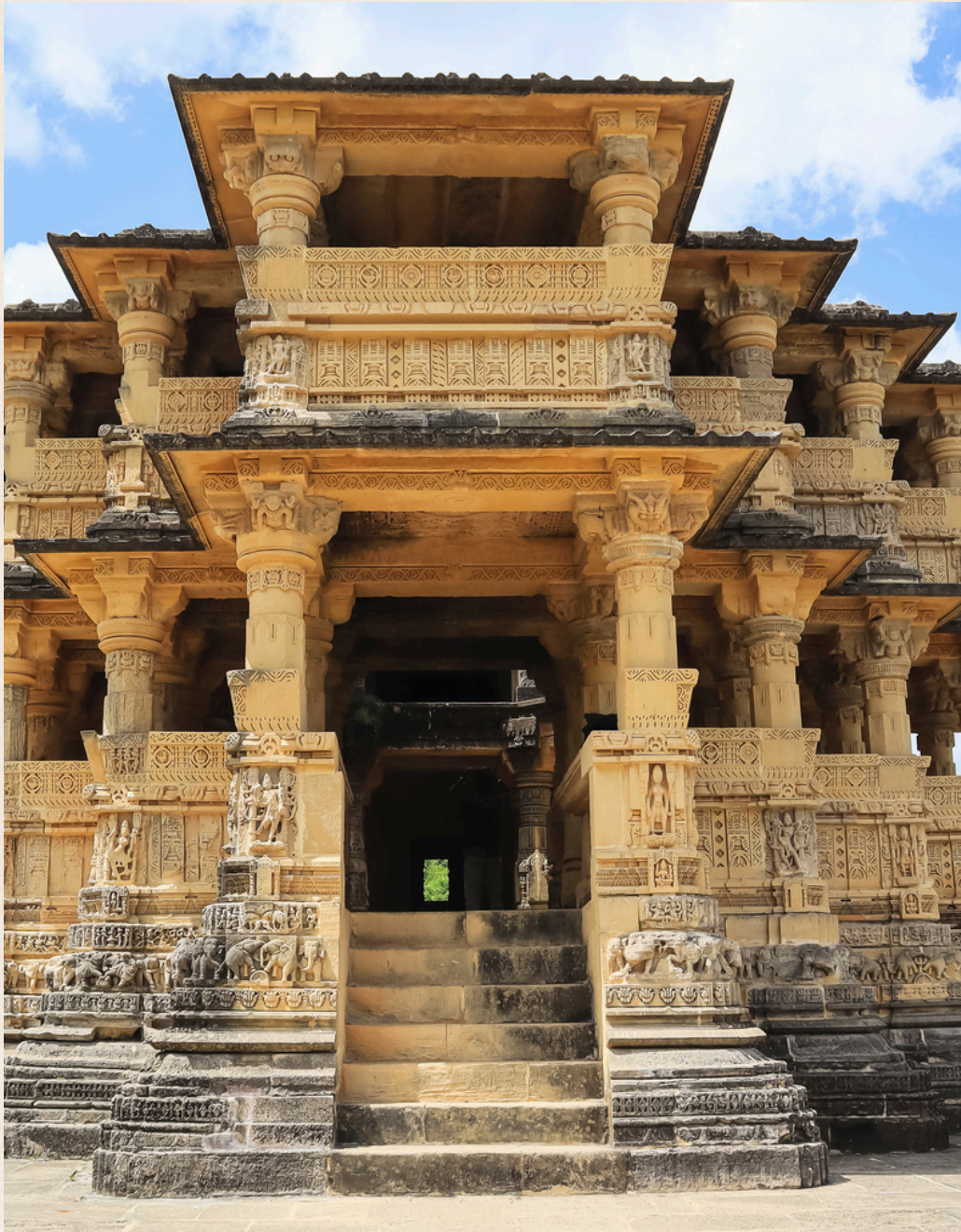
Above - Navlakha Temple in Dwarka stands as an ancient marvel, echoing the grandeur of Solanki-era temple architecture.