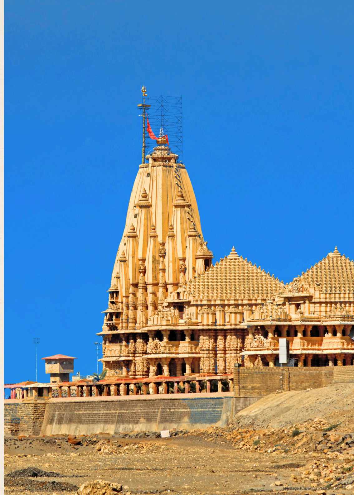
Right - A timeless symbol of devotion, standing proudly on the sacred shores of Gujarat, The Somnath Temple